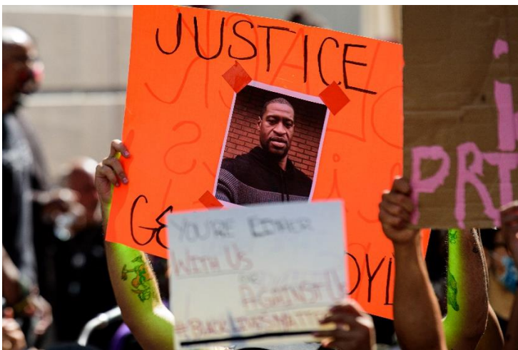
People are protesting in Miami, Florida, May 2020.